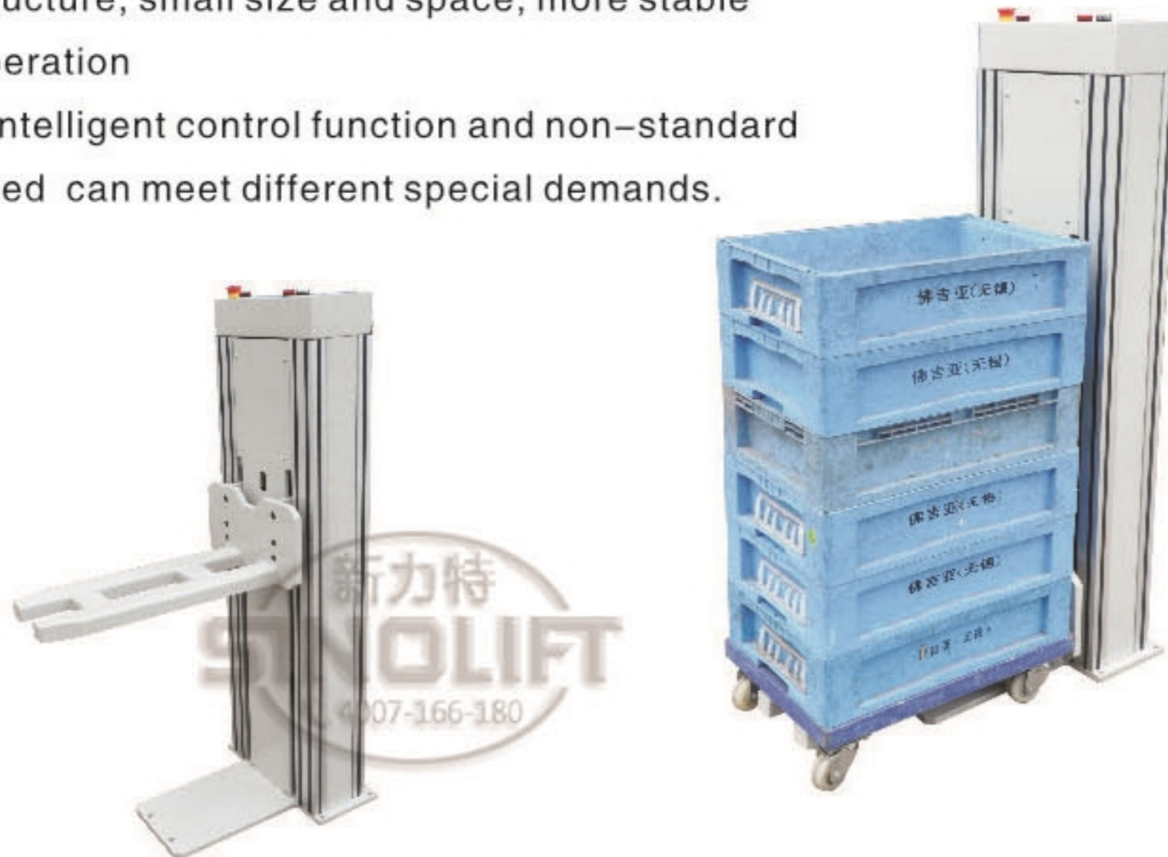
ED300/ED300-1 标准控制型 Standard control